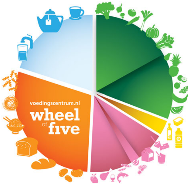
Fig. 2 Wheel of Five: graphical representation of the food-based dietary guidelines for the Netherlands